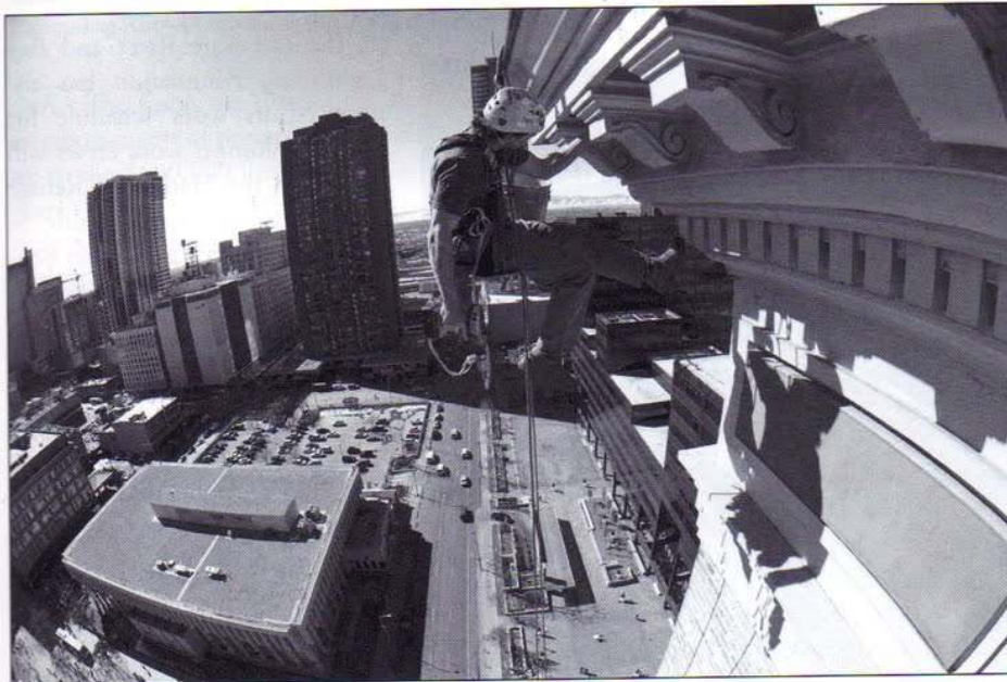
A worker dangles above the city skyline while working on decorative roof brackets.

Rope access attracts people from all occupations to its field, and these people bring with them some high-tech knowledge. Most companies that specialize in rope access do not offer just one service. It would not be unusual for a rope access company to complete a painting project on a building one day and blade reconstruction on a wind turbine the next. Companies put emphasis not only in rope access skills but the trade skills as well. They routinely can supply workers such as painters, welders, and inspectors who are trained and competent in such trades. Travel is a fundamental part of any rope access employee and company. Although time and money can be saved using rope access, the best benefit is non-invasiveness. When crews are at work, usually no one notices them and has no idea that repair work is being completed. There is no part of a maintenance plan that cannot utilize the great benefits from rope access, whether a lighthouse is 50 feet or over 300 feet tall. Rope access is a cost effective, less intrusive, way to repair your lighthouse.